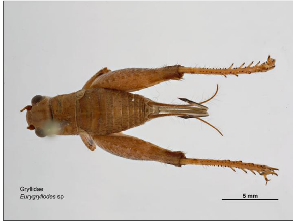
Site N17: Western Australia: Barrow Island 6 May 2006 S. Callan R. Graham. Det DCF Rentz, 2008 Dorsal Image - Female: Sarah McCaffrey Museum Victoria