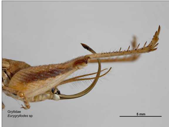
Site N17: Western Australia: Barrow Island 6 May 2006 S. Callan R. Graham. Det DCF Rentz, 2008 Hindleg Image - Female: Sarah McCaffrey Museum Victoria