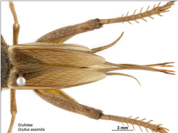
ORT4 Wing - Nymph: Caroline Harding MAF