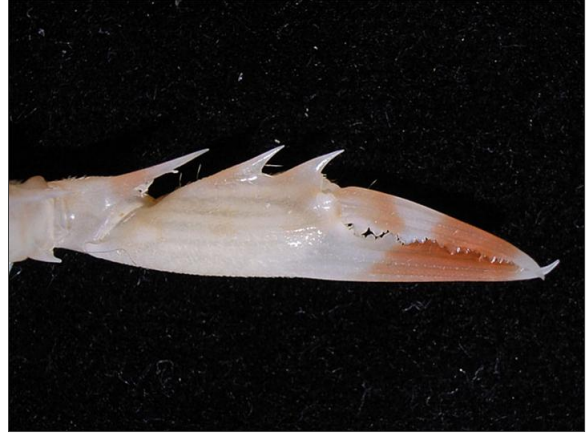
Photo of preserved specimen Locality: off Ningaloo North, Western Australia, Australia Chela: E. Dane Museum Victoria