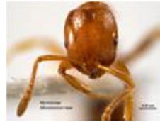
Monomorium leae Crawley (Hymenoptera: Formicidae: Myrmicinae) Reliability: High Status: Native to Barrow Island

Pennant ant - Tetramorium sjostedti: Live link: http://www.padil.gov.au:80/barrow-island/Pest/Main/136729