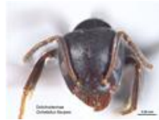
Ochetellus flavipes (Kirby) (Hymenoptera: Formicidae: Dolichoderinae) Reliability: High Status: Native to Barrow Island

Tachinidae - barr 04: Live link: http://www.padil.gov.au:80/barrow-island/Pest/Main/137263