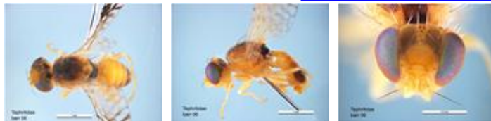
Tephritidae barr 06 barr 06 (Diptera: Tephritidae) Reliability: High Status: Native to Barrow Island

Fruit Fly - Tephritid barr 06: Live link: http://www.padil.gov.au:80/barrow-island/Pest/Main/137285