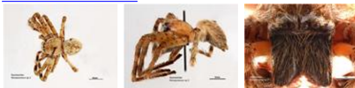
Neosparassus sp 2 - (Araneae: Sparassidae) Reliability: High Status: Native to Barrow Island

Huntsman Spider - Neosparassus sp 2: Live link: http://www.padil.gov.au:80/barrow-island/Pest/Main/137092