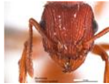
Tetramorium sjostedti Forel (Hymenoptera: Formicidae: Myrmicinae) Reliability: High Status: Native to Barrow Island

Signal Fly - Platystomatid barr 02: Live link: http://www.padil.gov.au:80/barrow-island/Pest/Main/137328