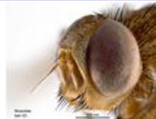
Tachinidae barr 04 barr 04 (Diptera: Tachinidae) Reliability: High Status: Native to Barrow Island