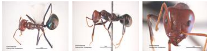
Iridomyrmex sanguineus Forel (Hymenoptera: Formicidae: Dolichoderinae) Reliability: High Status: Native to Barrow Island

Fly - Canacidae barr-03: Live link: http://www.padil.gov.au:80/barrow-island/Pest/Main/137289