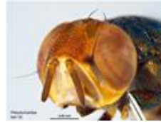
Platystomatidae barr 02 barr 02 (Diptera: Platystomatidae) Reliability: High Status: Native to Barrow Island

Spinifex ant - Ochetellus flavipes: Live link: http://www.padil.gov.au:80/barrow-island/Pest/Main/136759