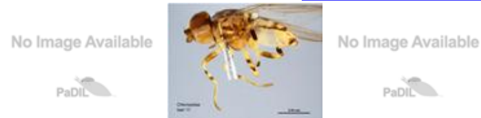
Chloropidae barr 11 barr 11 (Diptera: Chloropidae) Reliability: High Status: Native to Barrow Island

Gout Fly - Chloropid barr 11: Live link: http://www.padil.gov.au:80/barrow-island/Pest/Main/137308