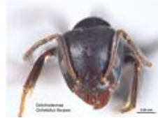
Ochetellus flavipes (Kirby) (Hymenoptera: Formicidae: Dolichoderinae) Reliability: High Status: Native to Barrow Island

Tachinidae - barr 04: Live link: http://www.padil.gov.au:80/barrow-island/Pest/Main/137263