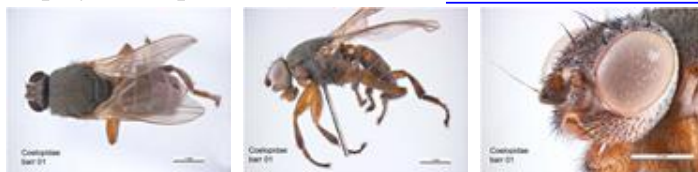
Coelopidae barr-01 (Diptera: Coelopidae) Reliability: High Status: Native to Barrow Island

Kelp fly - Coelopidae barr-01: Live link: http://www.padil.gov.au:80/barrow-island/Pest/Main/137296