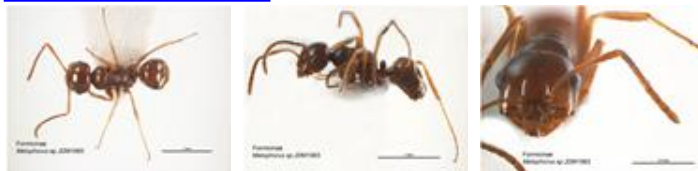
Melophorus paramorphomenus Heterick, Castalanelli & Shattuck (Hymenoptera: Formicidae: Formicinae) Reliability: High Status: Native to Barrow Island

Furnace ant - Melophorus paramorphomenus : Live link: http://www.padil.gov.au:80/barrow-island/Pest/Main/136685