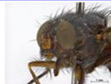
Calliphora sp. (Diptera: Calliphoridae: Calliphorinae: Calliphorini) Reliability: High Status: 0 Unknown

Carrot Fly: Live link: http://www.padil.gov.au:80/maf-border/Pest/Main/140624