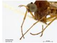
Sylvicola sp. (Diptera: Anisopodidae: Anisopodinae) Reliability: High Status: 0 Unknown