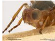
Lasionemopoda hirsuta (de Meijere, 1906) (Diptera: Sepsidae) Reliability: High Status: 0 Unknown

Bluebottle Fly: Live link: http://www.padil.gov.au:80/maf-border/Pest/Main/140508