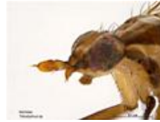
Telostylus sp. (Diptera: Neriidae) Reliability: High Status: 0 Unknown

Bibionid Fly: Live link: http://www.padil.gov.au:80/maf-border/Pest/Main/140506