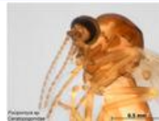
Forcipomyia sp. (Diptera: Ceratopogonidae: Forcipomyiinae) Reliability: High Status: 0 Unknown

Black Scavenger Fly: Live link: http://www.padil.gov.au:80/maf-border/Pest/Main/140632