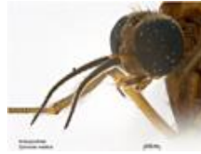
Sylvicola notatus Hutton, 1902 (Diptera: Anisopodidae: Anisopodinae) Reliability: High Status: 0 Unknown

Wood Gnat: Live link: http://www.padil.gov.au:80/maf-border/Pest/Main/140503