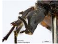
Dilophus nigrostigma (Walker, 1848) (Diptera: Bibionidae: Bibioninae) Reliability: High Status: 0 Unknown

Biting Midge: Live link: http://www.padil.gov.au:80/maf-border/Pest/Main/140520