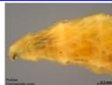
Chamaepsila rosae (Fabricius, 1794) (Diptera: Psilidae) Reliability: High Status: 0 Unknown

Cluster Fly: Live link: http://www.padil.gov.au:80/maf-border/Pest/Main/140512