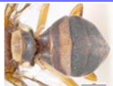
Bactrocera tryoni (Froggatt) (Diptera: Tephritidae: Dacinae) Reliability: High Status: High

Singapore ant: Live link: http://www.padil.gov.au:80/thai-bio/Pest/Main/140453