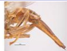
Anastrepha ludens (Loew) (Diptera: Tephritidae) Reliability: High Status: High

Oriental Fruit Fly: Live link: http://www.padil.gov.au:80/thai-bio/Pest/Main/140446