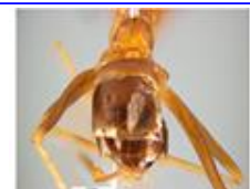
Anoplolepis gracilipes (Smith) (Hymenoptera: Formicidae: Formicinae) Reliability: High Status: Low