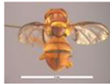
Bactrocera jarvisi (Tryon) (Diptera: Tephritidae: Dacinae) Reliability: High Status: High

Mango fruit fly: Live link: http://www.padil.gov.au:80/thai-bio/Pest/Main/140445