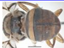
Bactrocera dorsalis (Hendel) (Diptera: Tephritidae: Dacinae) Reliability: High Status: Unknown

Queensland fruit Fly: Live link: http://www.padil.gov.au:80/thai-bio/Pest/Main/140427