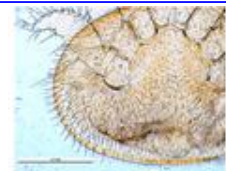
Varroa destructor Anderson & Trueman (Arachnida: Acari: Varroidae) Reliability: High Status: Unknown

Yellow crazy ant : Live link: http://www.padil.gov.au:80/thai-bio/Pest/Main/140441