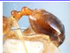
Monomorium destructor (Jerdon) (Hymenoptera: Formicidae: Myrmicinae) Reliability: High Status: Unknown

Varroa Mite: Live link: http://www.padil.gov.au:80/thai-bio/Pest/Main/140447