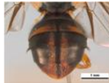
Bactrocera frauenfeldi (Schiner) (Diptera: Tephritidae: Dacinae) Reliability: High Status: High

Mexican fruit fly: Live link: http://www.padil.gov.au:80/thai-bio/Pest/Main/140439