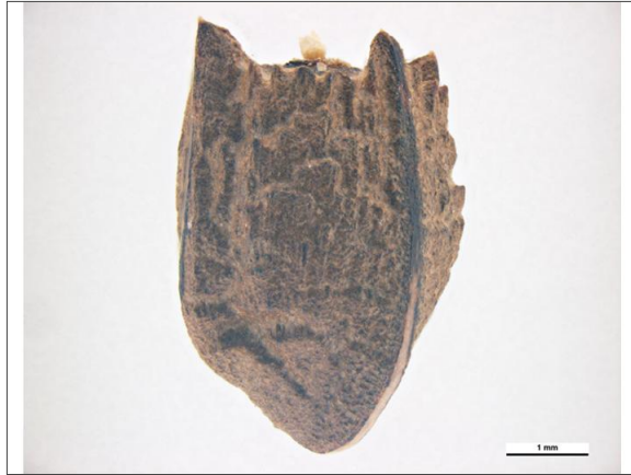
Seed Project Achene Dorsal