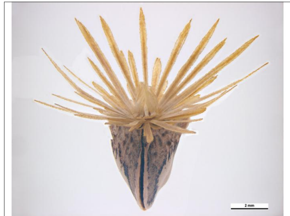
Seed Project Achene with pappus: Clare McLellan Museum Victoria