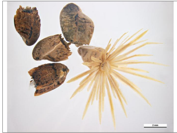
Seed Project Group