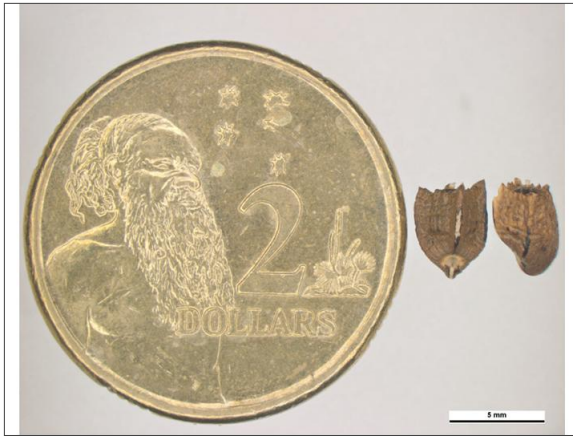
Australian $2 Coin with fruits Coin compare: Clare McLellan Museum Victoria