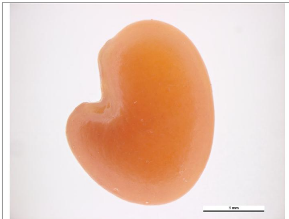
Seed Project Seed Lateral: Clare McLellan Museum Victoria