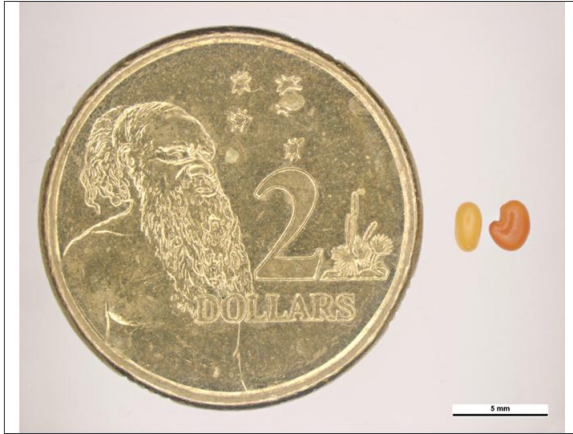
Australian $2 Coin with seeds Coin compare: Clare McLellan Museum Victoria