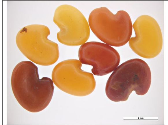
Seed Project Group