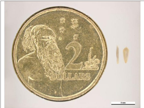
Australian $2 Coin with achene Coin compare: Clare McLellan Museum Victoria