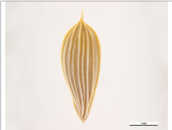
Seed Project Achene Ventral