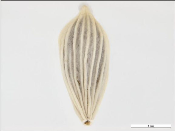
Seed Project Achene Base: Clare McLellan Museum Victoria