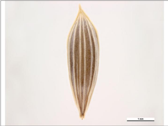
Seed Project Achene Dorsal