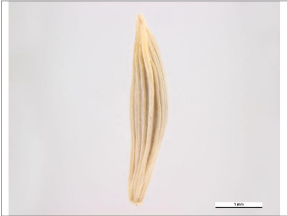
Seed Project Achene Lateral: Clare McLellan Museum Victoria