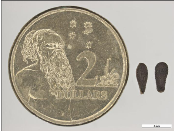
Australian $2 Coin with seeds Coin compare: Clare McLellan Museum Victoria