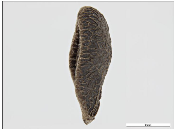
Seed Project Seed Lateral : Clare McLellan Museum Victoria