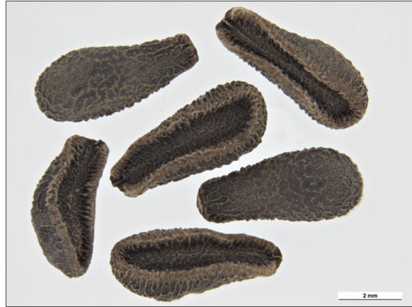
Seed Project Group