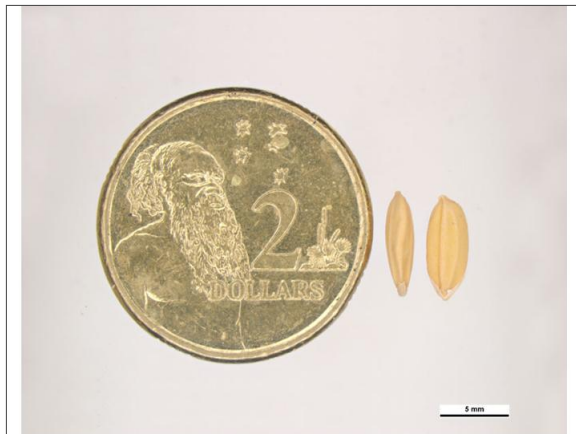
Australian $2 Coin with florets Coin compare: Clare McLellan Museum Victoria