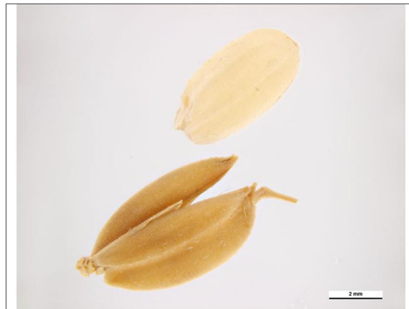
Seed Project Florets and