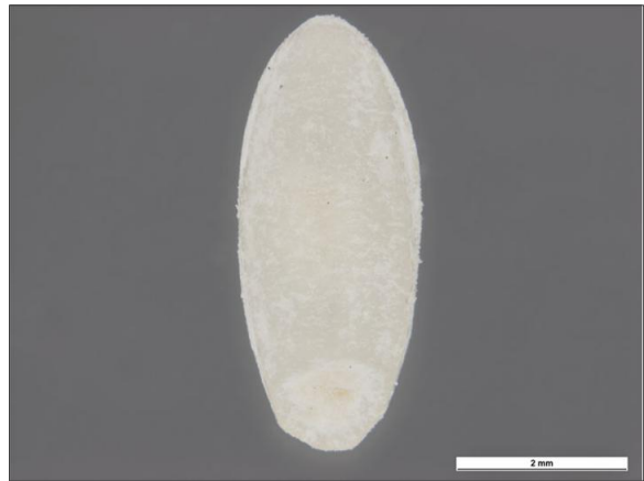
Seed Project Seed Ventral: Clare McLellan Museum Victoria