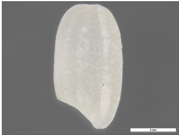
Seed Project Seed Lateral : Clare McLellan Museum Victoria