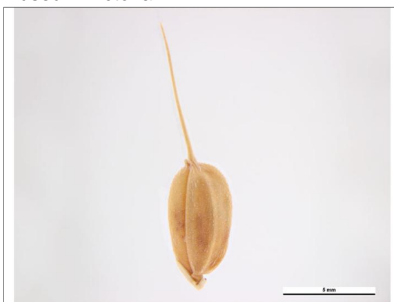
Seed Project Floret with awn