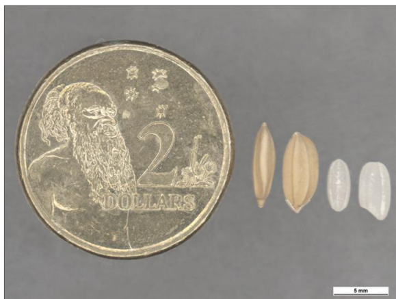
Australian $2 Coin with seeds Coin compare: Clare McLellan Museum Victoria