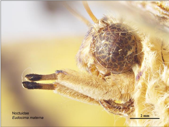
Site N/A: Western Australia: Barrow Island Headside