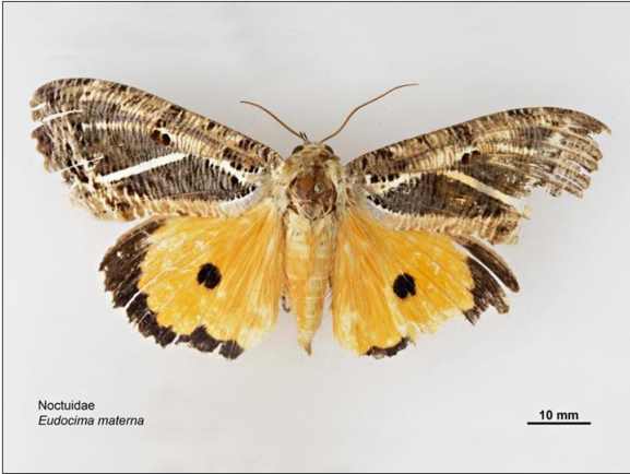
Site N/A: Western Australia: Barrow Island Dorsal