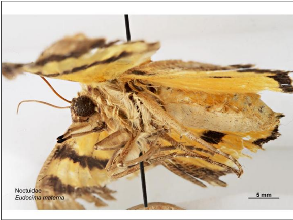
Site N/A: Western Australia: Barrow Island Lateral