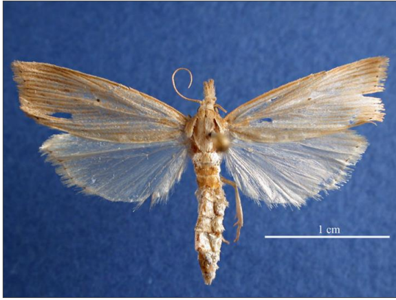
Dorsal View - Female: Rebecca Graham Department of Agriculture Western Australia