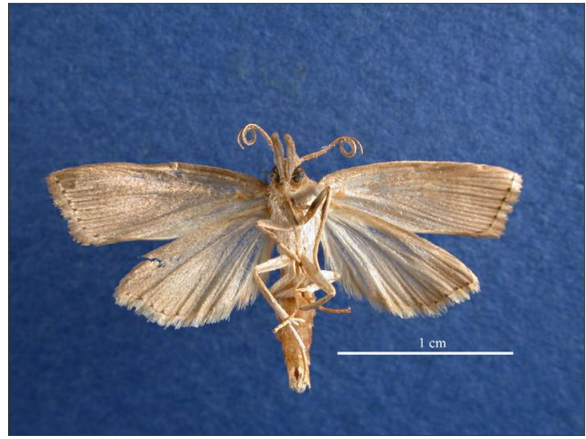
Ventral View - Male: Rebecca Graham Department of Agriculture Western Australia