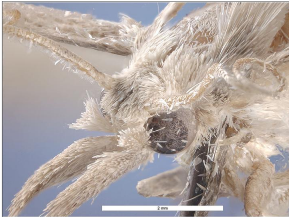
Head Side View: Willow Warren Department of Agriculture Western Australia