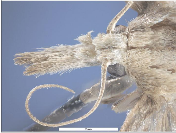
Head Dorsal View: Willow Warren Department of Agriculture Western Australia