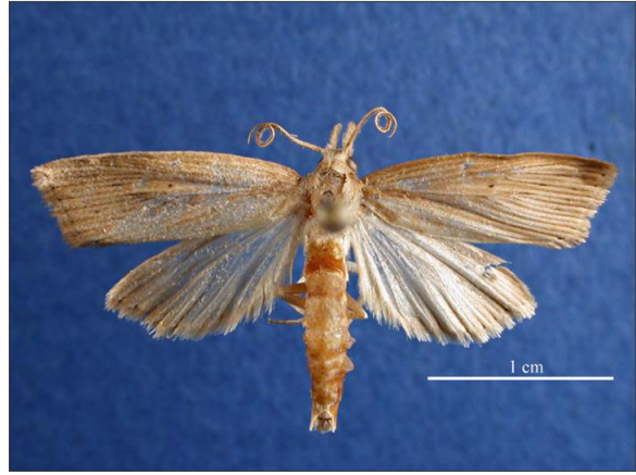
Dorsal View - Male: Rebecca Graham Department of Agriculture Western Australia