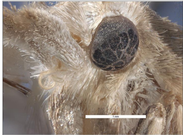
Head Side View: Willow Warren Department of Agriculture Western Australia