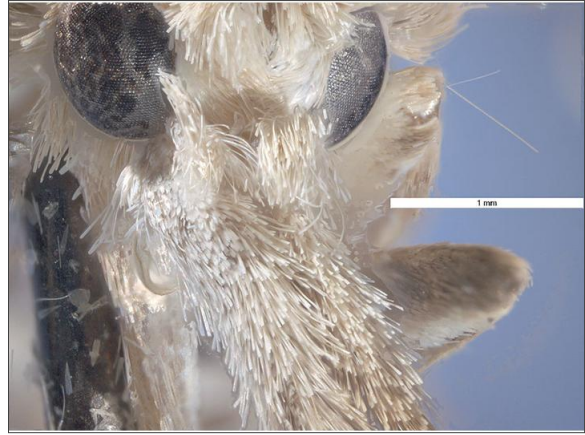
Head Front View: Willow Warren Department of Agriculture Western Australia