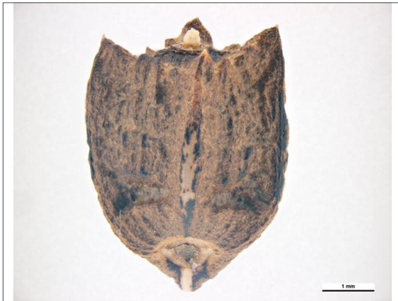
Seed Project Achene Ventral