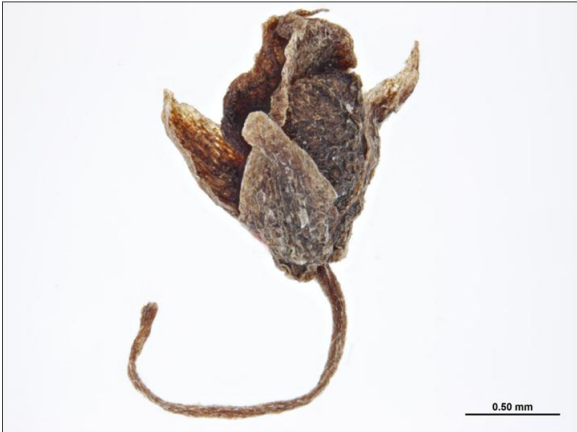
Seed Project Achene with floral parts: Clare McLellan Museums Victoria