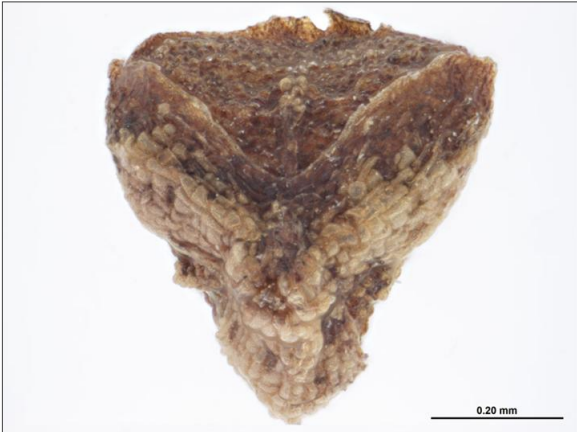
Seed Project Achene Ventral