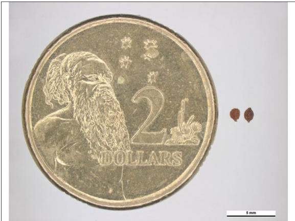
Australian $2 Coin with achenes Coin compare: Clare McLellan Museums Victoria