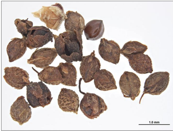
Seed Project Group