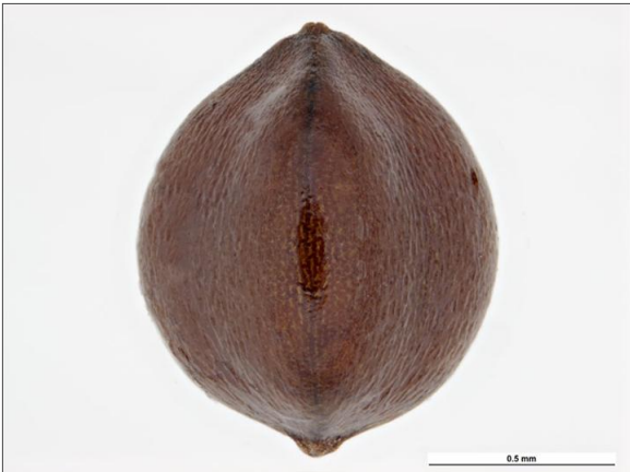
Seed Project Achene without floral parts