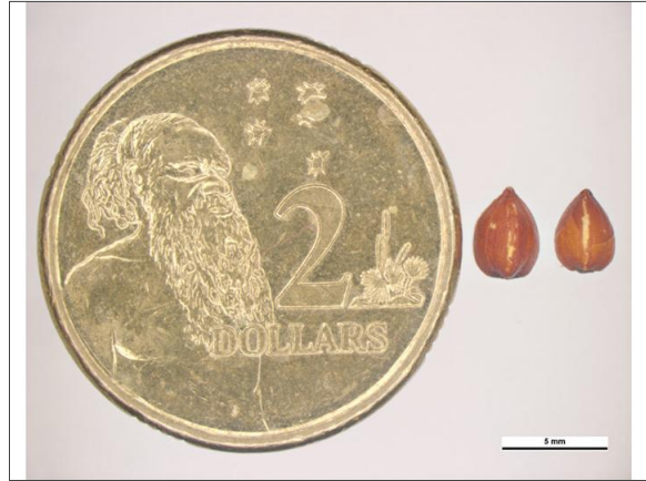
Australian $2 Coin with seeds Coin compare: Clare McLellan Museums Victoria