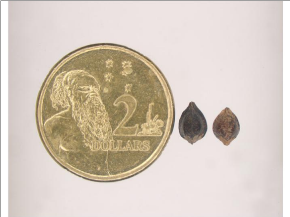
Australian $2 Coin with fruits Coin compare: Clare McLellan Museums Victoria