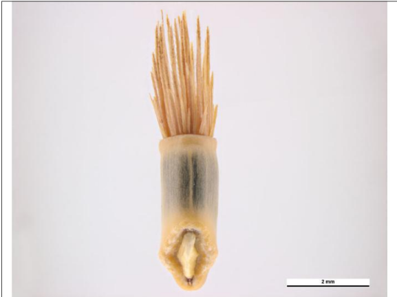
Seed Project Achene Ventral