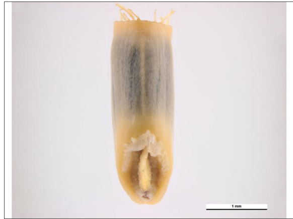
Seed Project Achene Ventral