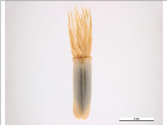
Seed Project Achene Dorsal