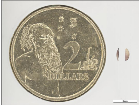
Australian $2 Coin with capsules Coin compare: Clare McLellan Museums Victoria