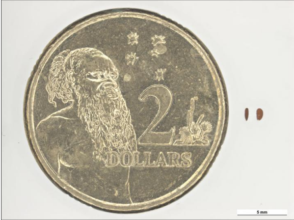
Australian $2 Coin with seeds Coin compare: Clare McLellan Museums Victoria