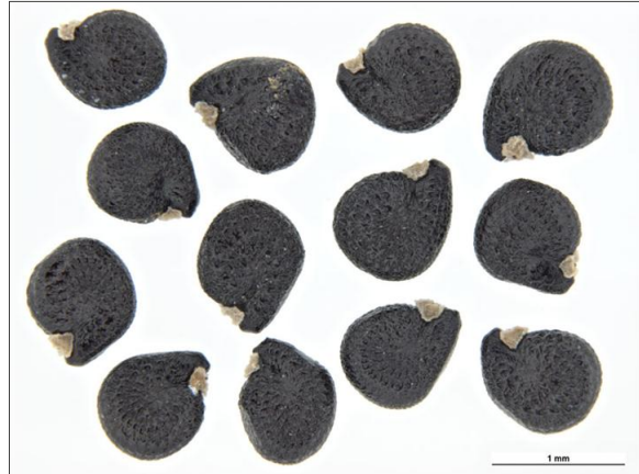
Seed Project Group