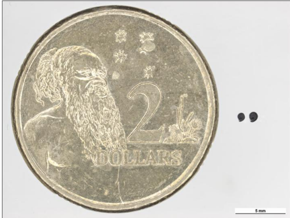
Australian $2 Coin with seeds Coin compare: Clare McLellan Museums Victoria