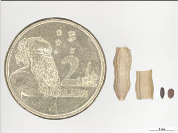
Australian $2 Coin with seeds and fruit Coin compare: Clare McLellan Museums Victoria