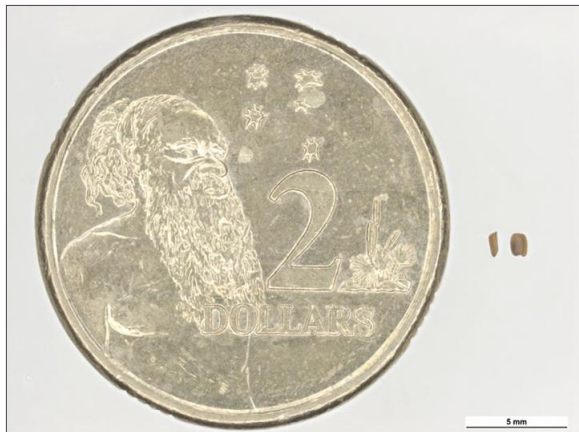
Australian $2 Coin with seeds Coin compare: Clare McLellan Museums Victoria